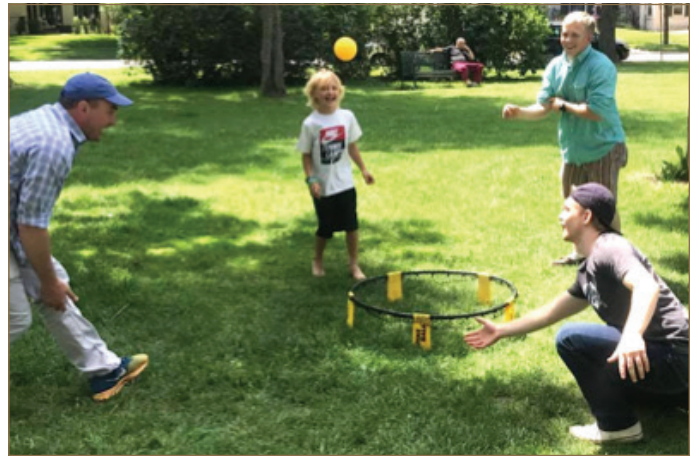
Spike Ball was the hit of our summer Pardee Party in the Park.

M.A. Global Finance, Trade, and Economic Integration, University of Denver (2017) – Josef Korbel School of International Studies