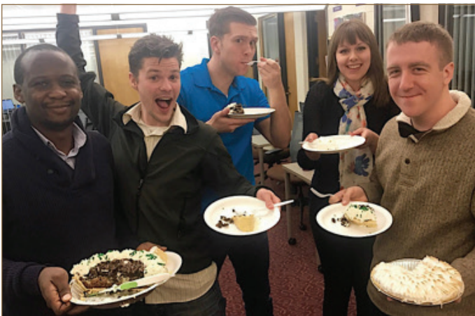
Our researchers celebrated PI DAY (03.14) with chocolate cream, banana cream, and lemon meringue.

M.A. Global Finance, Trade, and Economic Integration, University of Denver (2016) – Josef Korbel School of International Studies Research Associate II, Pardee Center for International Futures