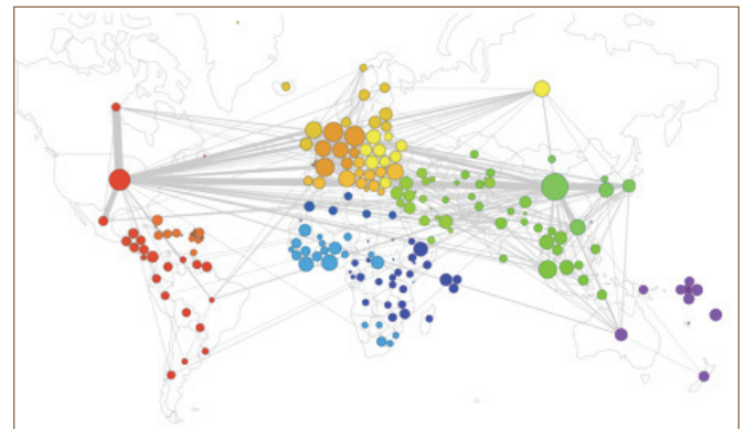
Visualization in EconDash: Global trade network in 2015, with line width representing the level of trade between two countries, bubble size representing the centrality of a country within the trade network, and color representing region.

EconDash is a collection of interactive data visualizations that allows users to explore patterns of behavior for country-level economic and network-based indicators across multiple decades. The first visualization we created measures changes in bilateral trade networks over time. The second, which is still in progress, is a tool for evaluating a country's vulnerability or resilience to economic shocks. Together, these public dashboards will help analysts better understand a country's structural exposure to economic crisis due to domestic conditions as well as their positioning within trade networks. EconDash draws on historical data from sources including the IMF Systemic Banking Crises Database, data from UN Comtrade, and French research center CEPII, as well as data and forecasts from the IFs platform.