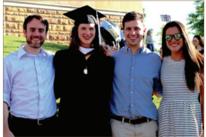
In June, 26 Pardee Center research assistants earned degrees from the University of Denver.

M.A. Global Finance, Trade, and Economic Integration, University of Denver (2017) – Josef Korbel School of International Studies Consultant, Western Cape Government