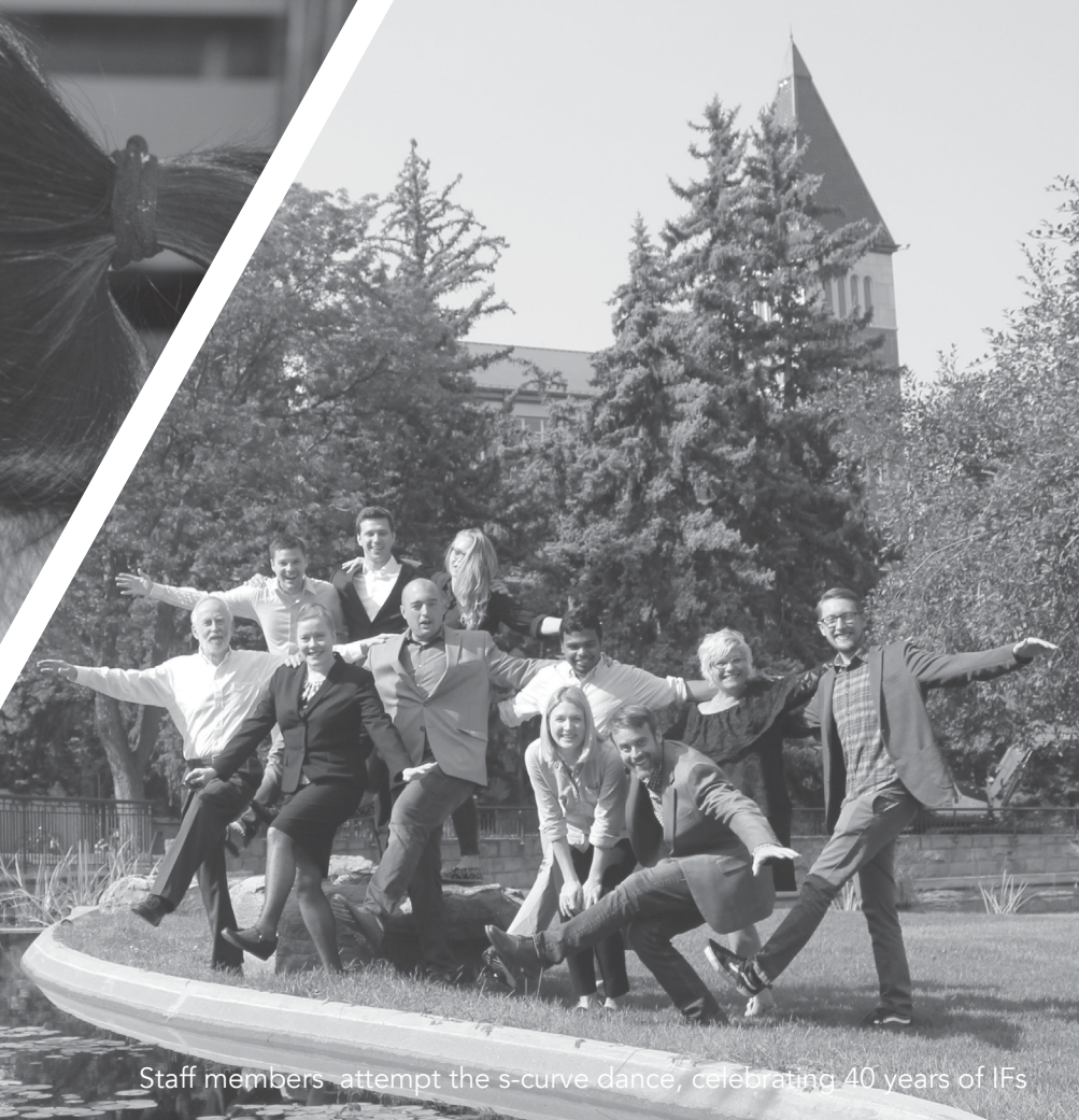
Staff members attempt the s-curve dance, celebrating 40 years of IFs